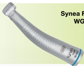
Synea Fusion WG-56LT