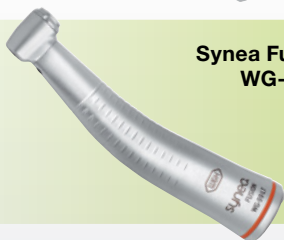
Synea Fusion WG-99LT