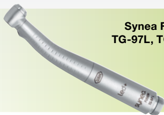
Synea Fusion TG-97L, TG-98L

Uncompromising user comfort with proven Synea quality. The series with top quality and maximum economy. Also available to suit Kavo & NSK connections.