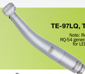
Algebra TE-97LQ, TE-98LQ

Algebra handpieces from W&H are reliable partners for daily use in your dental practice. Experience maximum efficiency during use combined with maximum safety for you and your patients.