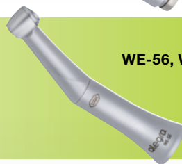
Algebra WE-56, WE-56T

Note: Requires W&H RQ-54 generator coupling for LED to operate.